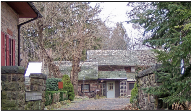
Historic barns and other farm buildings provide strong links to the Borough's agricultural heritage.

Barns, carriagehouses, well houses, garages that are stylistically similar to the principal building, and other historic accessory buildings contribute to the character of Closter's historic buildings and districts. Often mature trees, shrubs, gardens, and other landscape features are contributing historic elements. Compatible accessory buildings and landscaping do much to enhance the historic environment. Conversely, intrusive and inappropriate accessory buildings, landscaping, and outdoor mechanicals can significantly detract from a historic property's or district's sense of time and place.