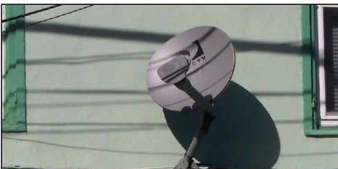
Not Recommended: Placing satellite dishes where visible to public view.