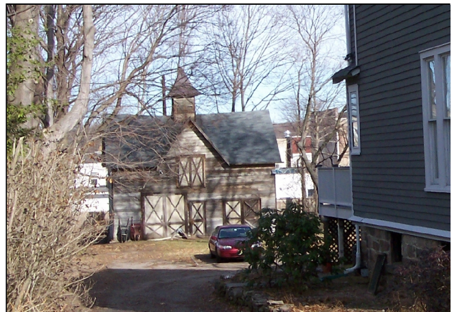
Recommended: Retain, maintain, and repair historic accessory buildings such as this carriage-house.