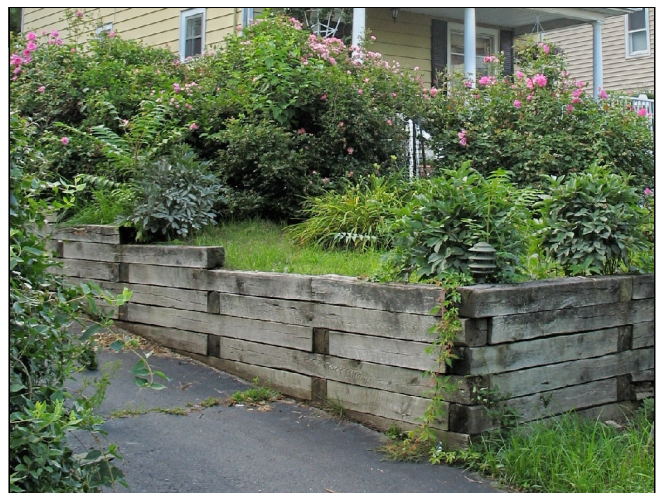
Not Recommended: Where visible from the public view, constructing retaining walls of landscape timbers.